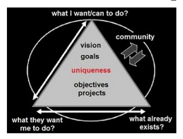
Figure 1: the relation between visions and projects